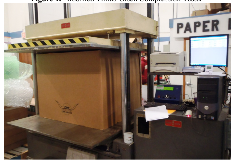
Figure 1. Modified Tinius-Olsen Compression Tester