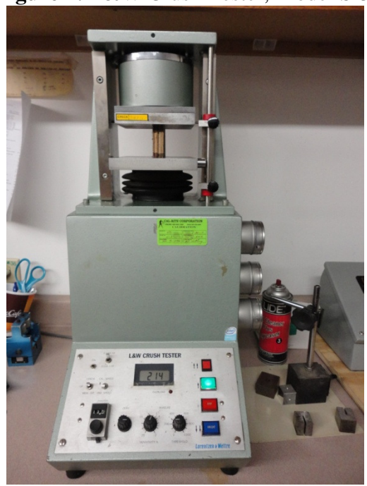
Figure 4: L&W Crush Tester, Model S-3

<u>Test Procedure:</u> Testing was conducted in accordance with applicable TAPPI T811 Standard Test Methods.