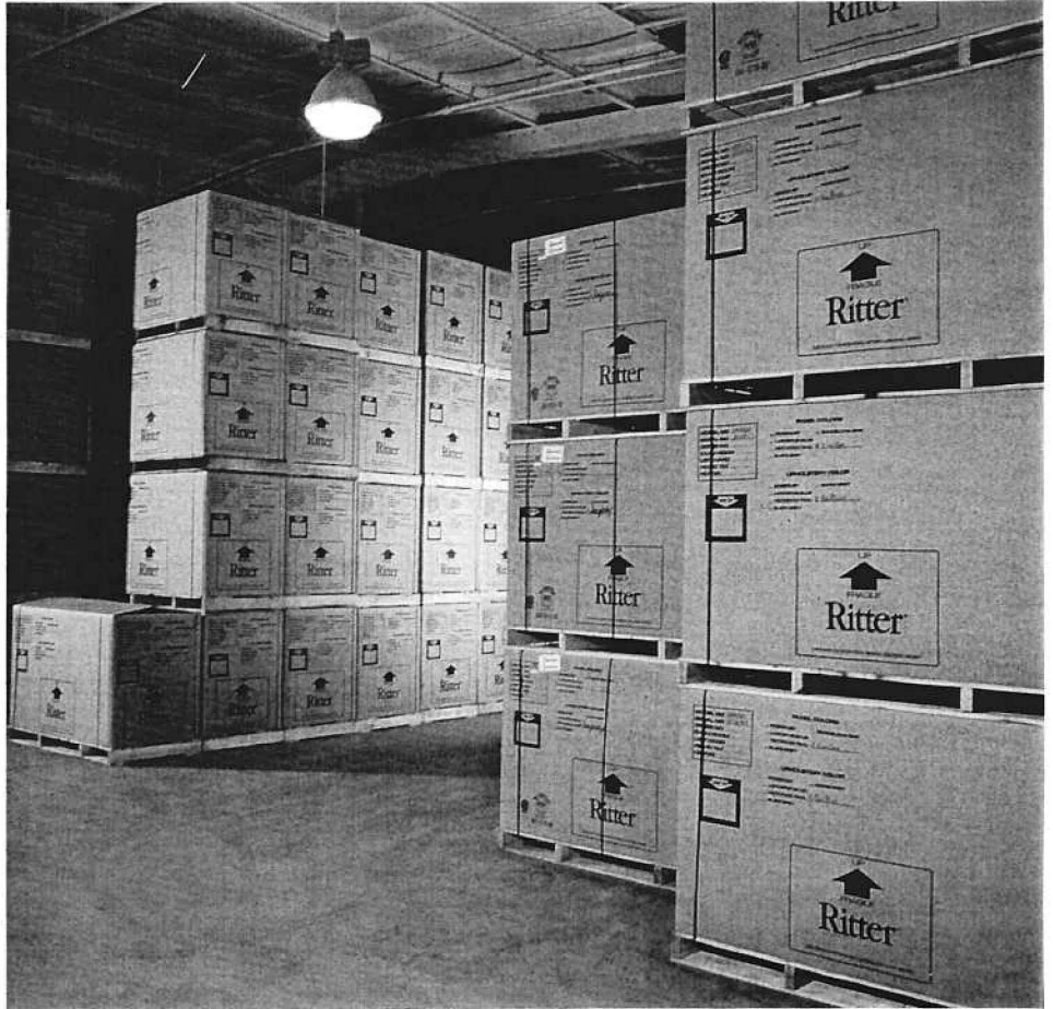
These packaged products, weighing 500 pounds and more, can be stacked up to four high.